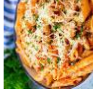
Penne Alla Vodka