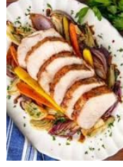
Sliced Pork Roast With Applesauce